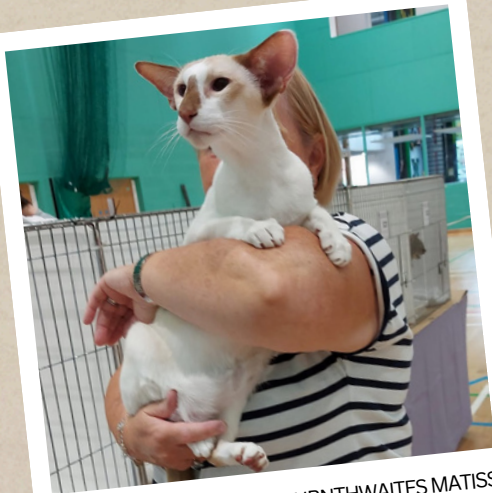
BEST NEUTER 2023 IGRPR BURNTHWAITES MATISSE